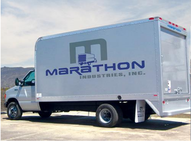
Sample box truck after assembly