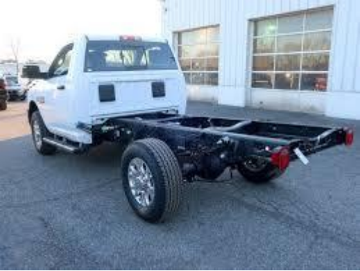
Dodge Ram Chassis without box